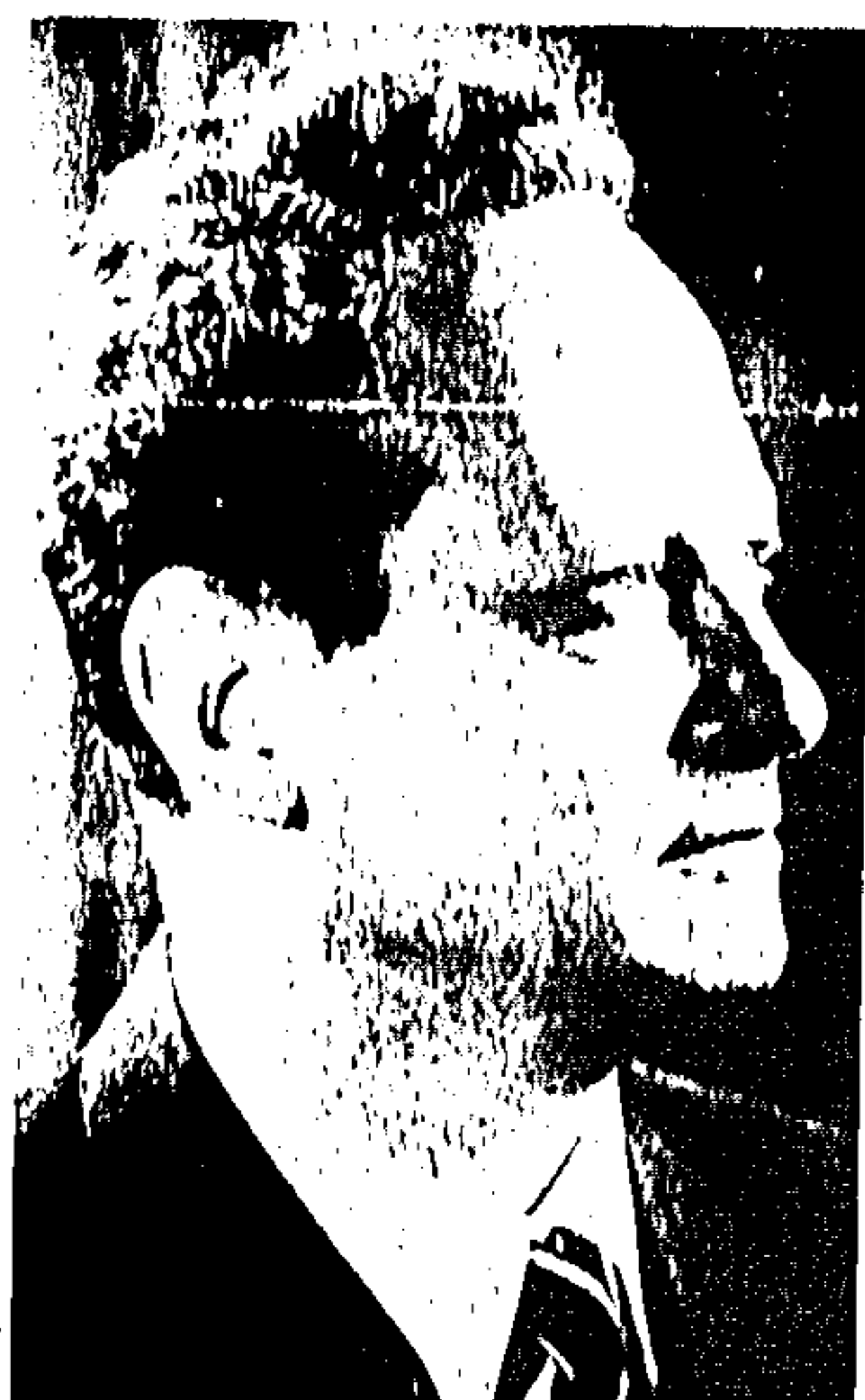
YIGAL ALLON Deputy Prime Minister of Israel

The entire community is urged to attend on April 23, to hear our distinguished visitor, to respond generously, to give more than ever before. In view of the large expected turnout, seating will be on a first come, first seated basis and the meeting will begin promptly at 8:00 p.m.